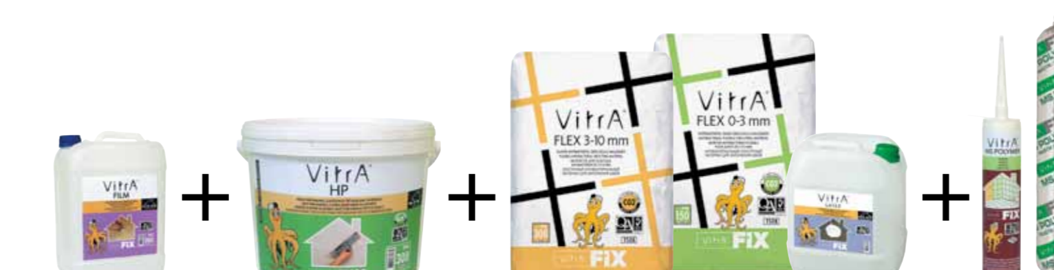
11 Tiling On Existing Tiles