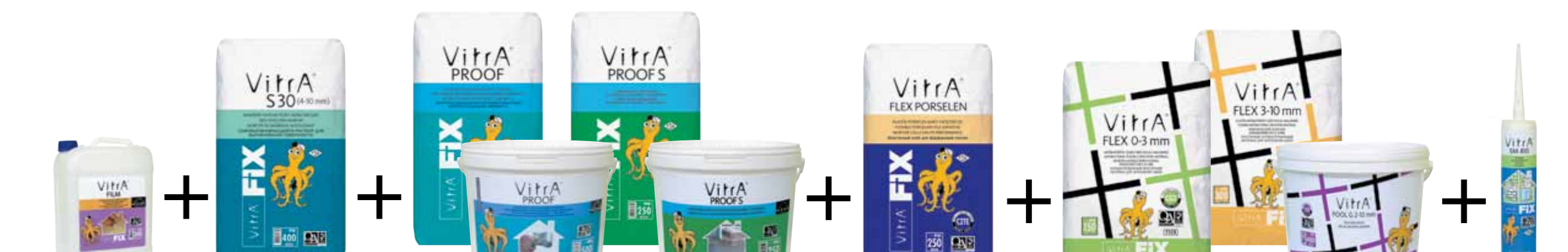
15 Tiling On Walls in Kitchens