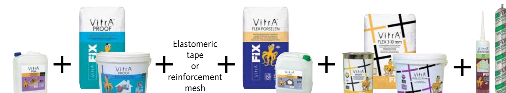
6 Water-Proofing and Tiling On Water-Tanks