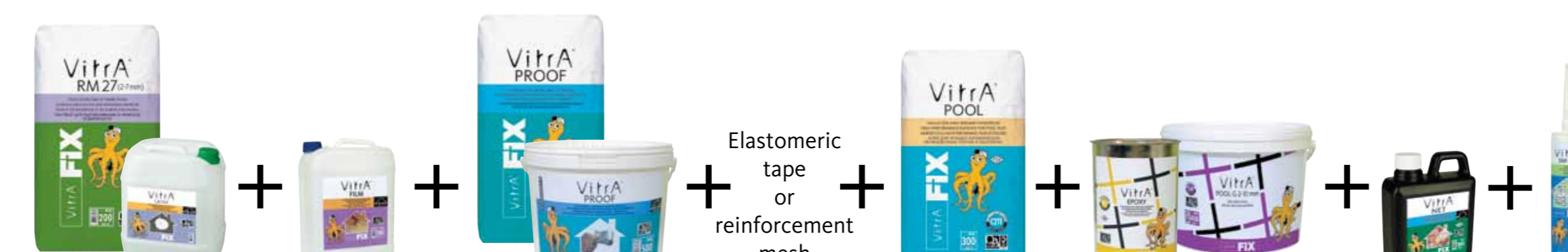
7 Tiling On Façades (Big Sized Tiles)