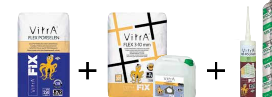
10 Tiling On Gypsum Pannels or Gypsum Plasters