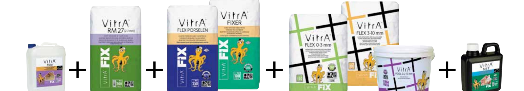
14 Water-Proofing and Tiling On Floors in Wet Areas