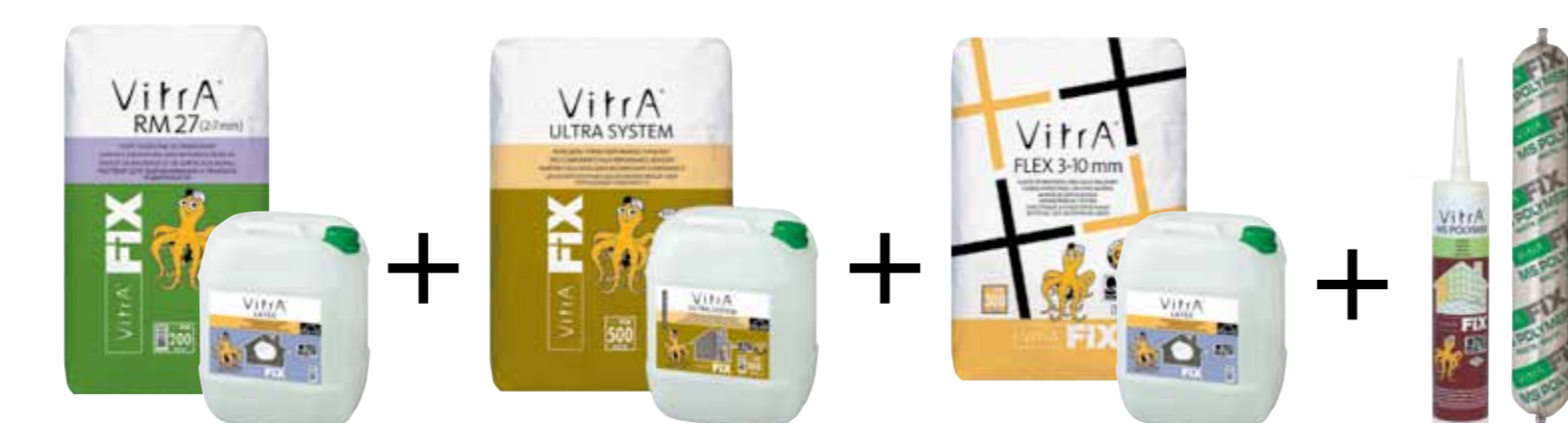
8 Tiling On Balconies and Terraces